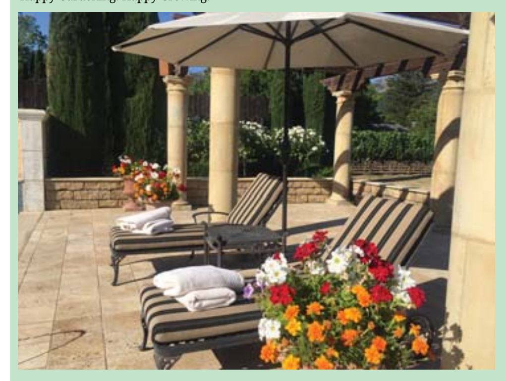
Comfortable lounge chairs under umbrellas for shade in the loggia.