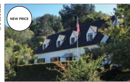
1 Sycamore Road 5 Bed 4.5 Bath 3,977± Sq Ft 1.24± Acres 1sycamore.com

Lic. 01051349 925.766.1136 tracy@tracykeaton.com tracykeaton.com