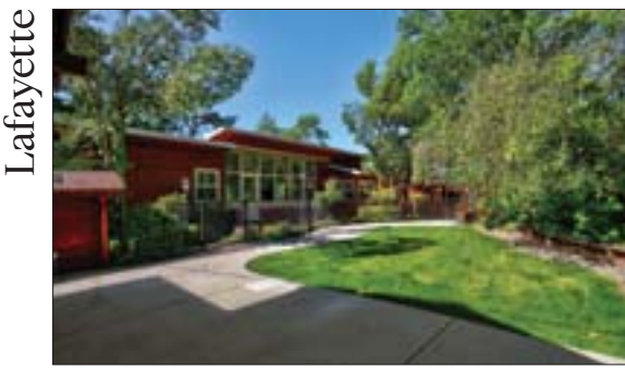
3651 Boyer Circle 5 Bed 4F/3H Bath 4,600± Sq Ft 0.96± Acres 3651boyer.com

Crown Jewel of Orindawoods..... over 2600 sq. ft. single story with level out yard and panoramic views from all the right rooms, including Master Bedroom, Living and Dining Rooms, Kitchen and extra large breakfast room....The home that everyone patiently waits for ... is coming soon!