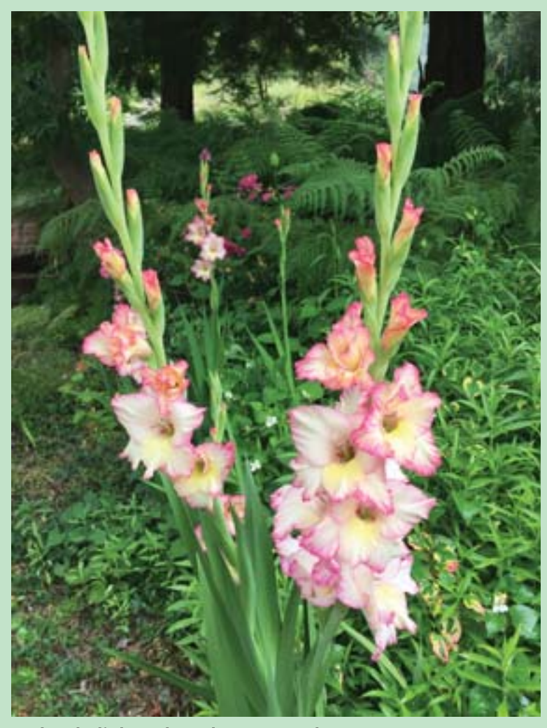
Stake gladiolus when they get top heavy.