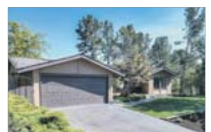
327 Calle La Mesa, Moraga Sold for $1,250,000 with 3 offers

Campolindo rancher with 4 bedrooms, 2 baths, and flat yard. Great area and location. Represented sellers.