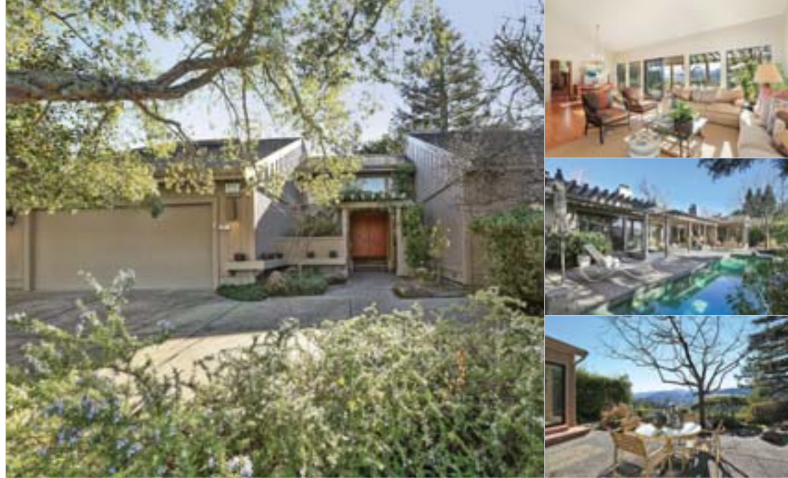
655 Crossridge Court $2,035,000