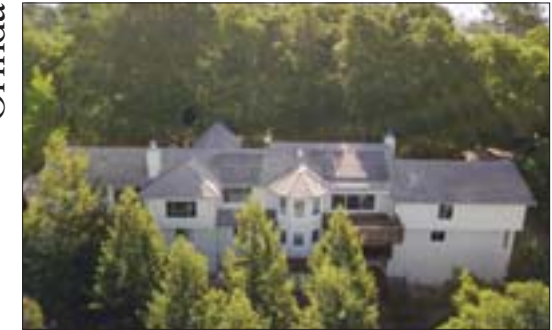
4 Oak Flat Road 3,007± Sq Ft 0.66± Acres 4 Bed 3.5 Bath 4oakflat.com