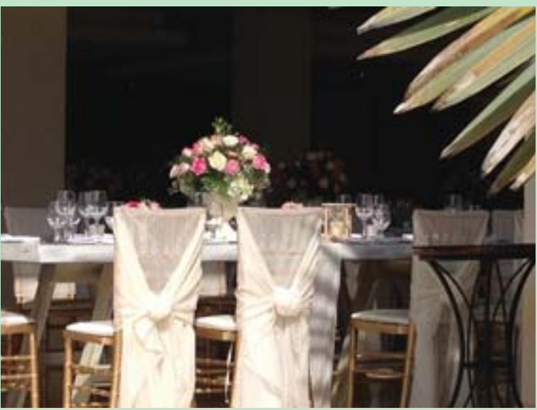
Turn outdoor dining into an elegant affair with gauzy fabrics and formal floral displays.