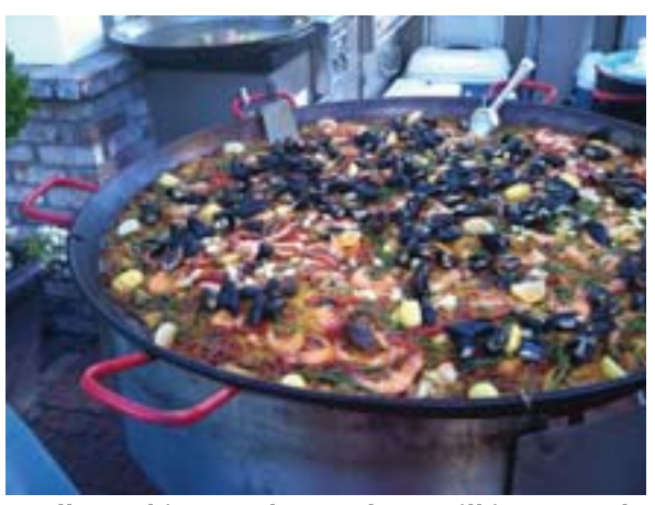
Paella cooking on the outdoor grill is a crowd pleaser.