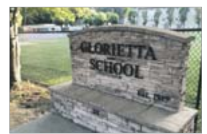
Off-Market in Glorietta, Orinda Sold for $1,800,000

Burton Valley stunner with remodeled kitchen, beautiful yard and good trail access. Represented buyers.