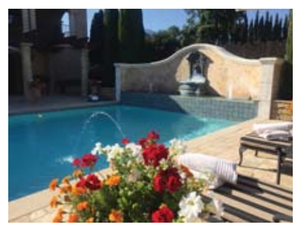
Make your pool resort-like with fountains, urns filled with flowers, and comfy chaises.

Here's a refreshing summer garden cocktail that I concocted for a girlfriend's birthday that is both luscious and appealing. Measure according to your liking.