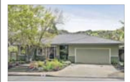
501 Bavarian Court, Lafayette Sold for $1,550,000 with 7 offers

Campolindo rancher with 4 bedrooms, 2 baths, and flat yard. Great area and location. Represented sellers.