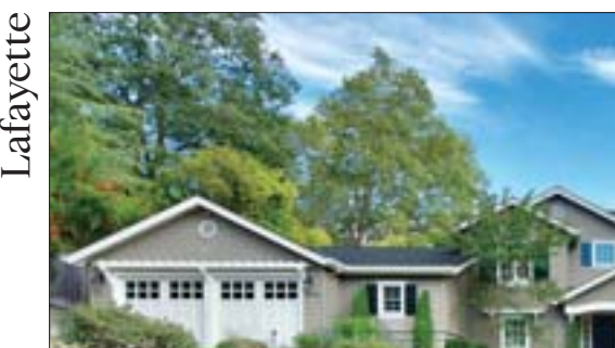
4+ Bed 4.5 Bath 3,716± Sq Ft 0.50± Acres 1140caminovallecito.com