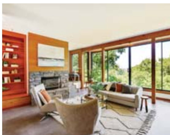
21 Woodcrest Road, Orinda 3 Bed | 3 Bath $1,375,000 21WoodcrestRd.com