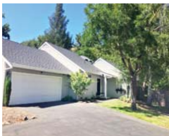
14 Moss Lane, Lafayette 2 Bed | 2 Bath $995,000 14MossLane.com