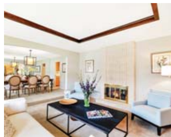
302 Claudia Court, Moraga 5 Bed | 2.5 Bath $1,595,000 302ClaudiaCt.com