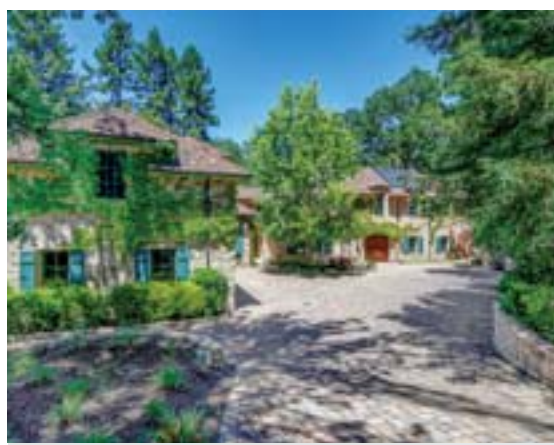
5 Canyon View Drive, Orinda 5+ Bed | 6.5 Bath $3,995,000 5CanyonViewDr.com

At Compass, we believe no barrier should stand between where you are and where you belong. By pairing knowledgeable agents with intuitive technology, we deliver a modern real estate experience in the San Francisco Bay Area and beyond.