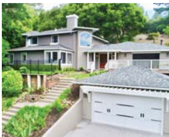
125 Sleepy Hollow Lane, Orinda 6 Bed | 4 Bath $2,470,000 125SleepyHollowLane.com