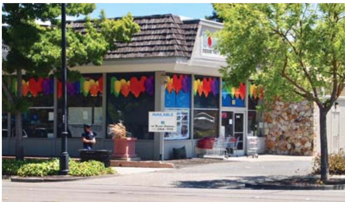
Boswell's closed its doors July 3.