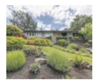
4018 Mario Way Represented Buyer