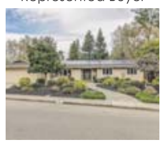
97 Corliss Drive Represented Buyer