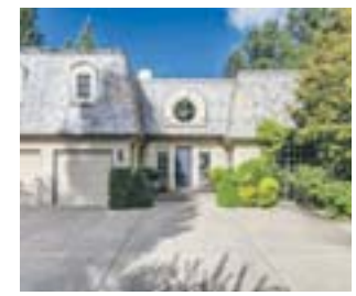
4030 Happy Valley Road Represented Seller