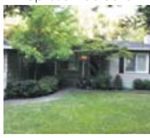
2551 Olympic Boulevard Represented Seller