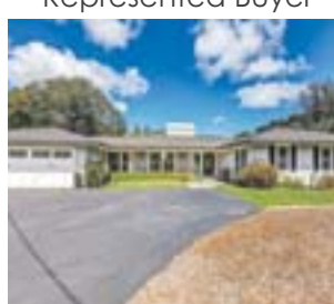
45 Tara Road Represented Buyer