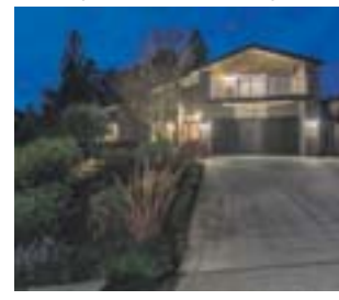
110 Quintas Lane Represented Seller