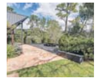
3913 Happy Valley Road Represented Seller