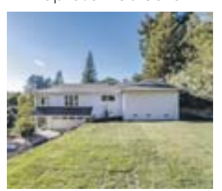
808 Las Trampas Road Represented Buyer