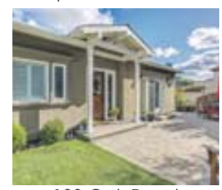
103 Oak Road Represented Seller