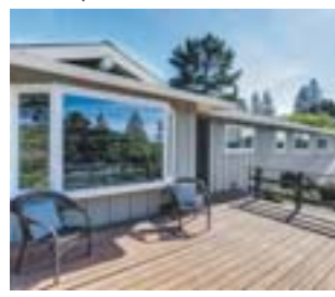
7 Carisbrook Drive Represented Buyer