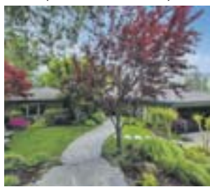
46 Hacienda Circle Represented Buyer