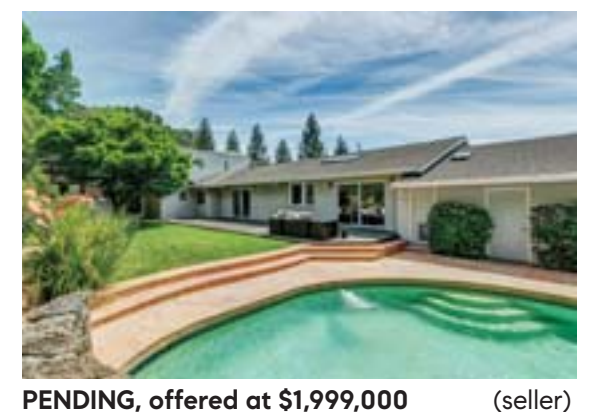
PENDING, offered at $1,999,000