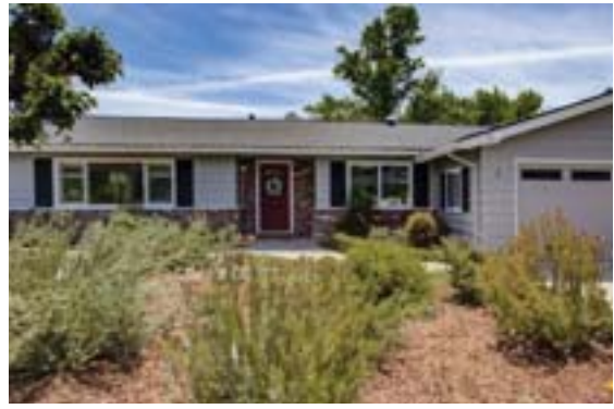
SOLD for $1,325,000