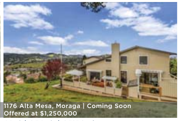
4 Bed | 2.5 Bath | 2,785 Sq. ft. 3D tour at www.1176AltaMesa.com