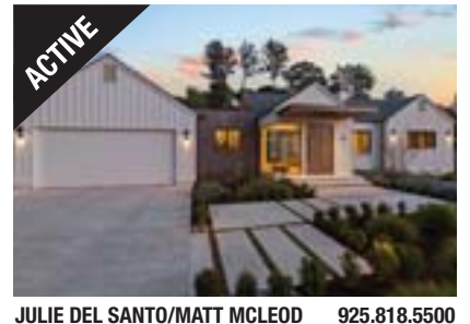
JULIE DEL SANTO/MATT MCLEOD