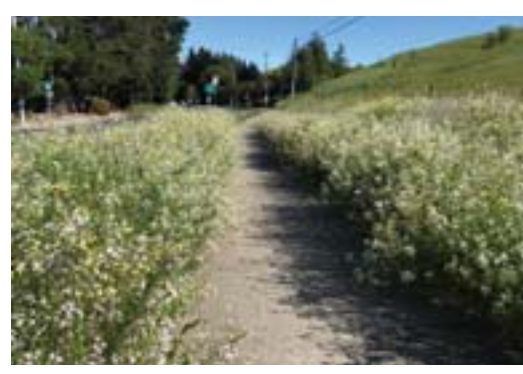
A moment of Zen in one Moraga man's backyard ... read on Page D6