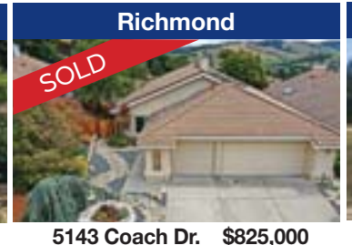
Gorgeous & smart 4BD/2BA updated home Build the home you've always dreamed of. w/ views! Received 8 offers over asking! www.melaniesnow.com Lic #00878893 BestLamorindaHomes.com Lic #01390784 www.14BerkeleyAve.com Lic #01390784 www.soraya4homes.com Lic #01771736 ChadMorrisonHomes.com Lic #01905614