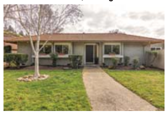
SOLD for $660,000