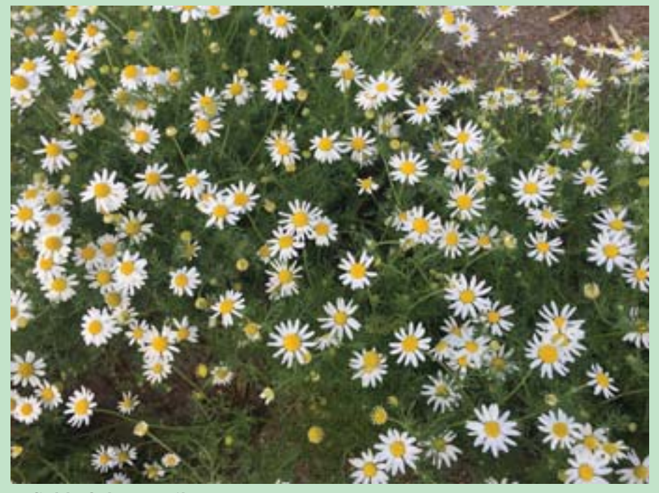
A field of chamomile.