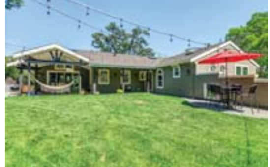
Listed at $1,750,000