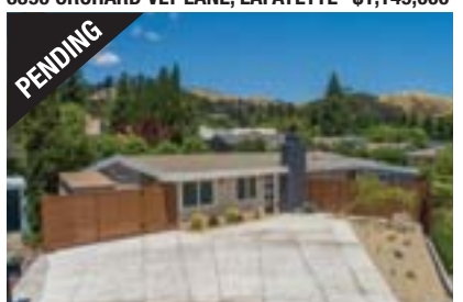
SMITH HOMES TEAM