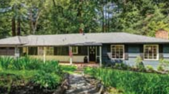
SOLD for $1,505,000