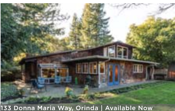
3+ Bed | 2 Bath | 2,285 Sq. ft. / .24 Acres 3D tour at www.DonnaMariaWay.com