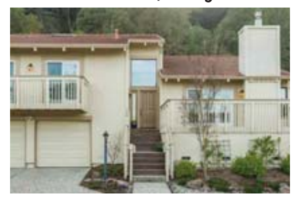
SOLD for $1,200,000