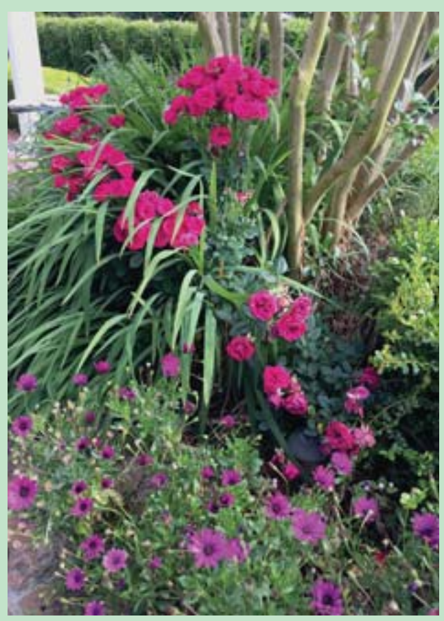
Miniature roses flanked by African daisies (osteospermum)

Happy gardening. Happy growing. Have a flowerful Fourth of July!