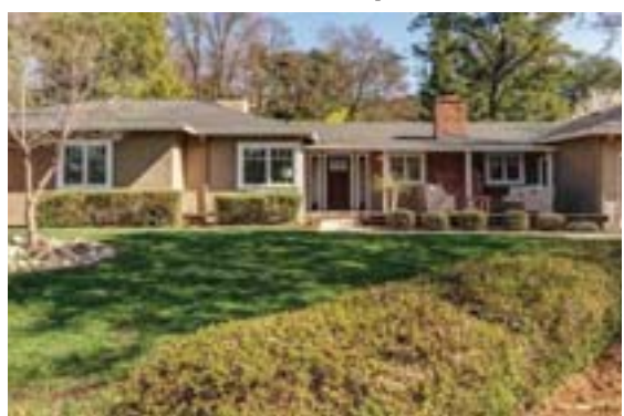
SOLD for $1,900,000