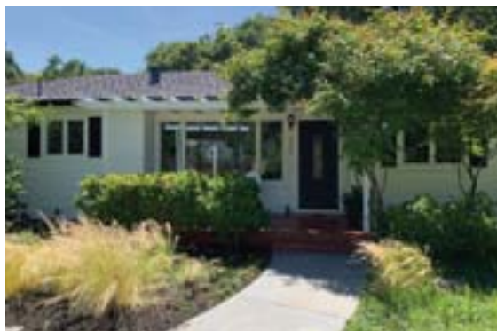
PENDING, offered at $1,845,000