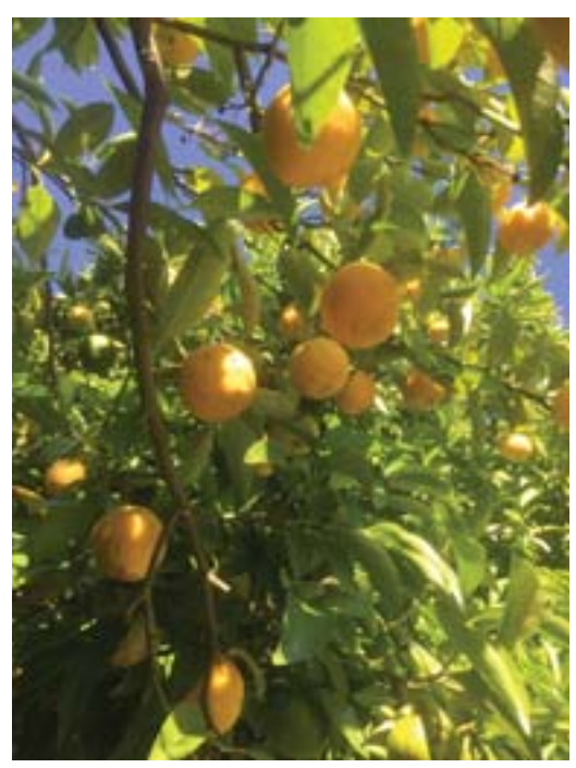
Branches filled with vitamin C rich tangelos.

What's your planet pivot? Stay safe. Stay healthy. Stay strong. Wash your hands. Cover your face!