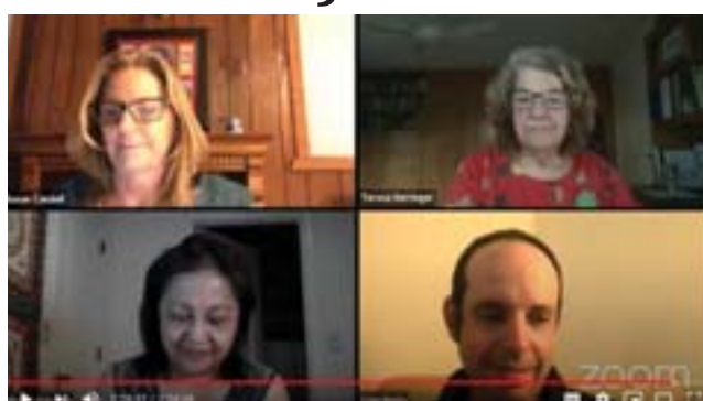
Screen shot from virtual meeting The newly-formed task force held its first meeting July 1.