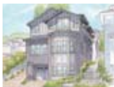
THE TILDEN | 4517 Howe Street