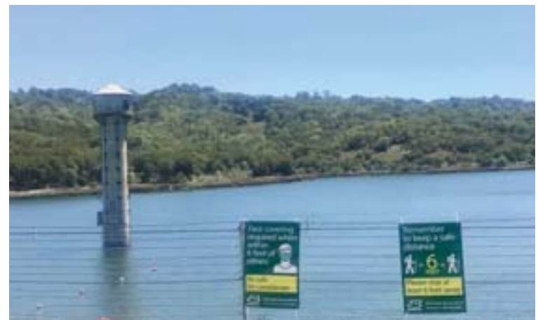
The signs are a reminder that even here, it is not exactly "back to usual"