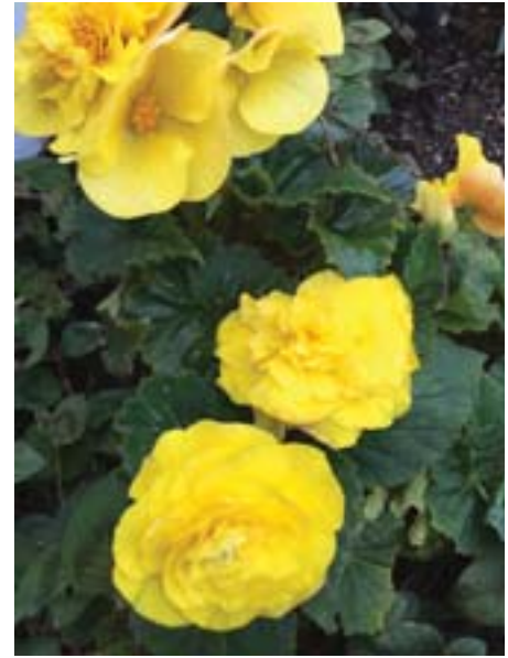
Poisonous to all pets, the genus Begoniaceae boasts over 1800 species of begonias.

Although you need to keep yourself and your dog well-hydrated in this hot weather, if you planted a succulent garden earlier in the season, you don't need to waste any water by running the irrigation