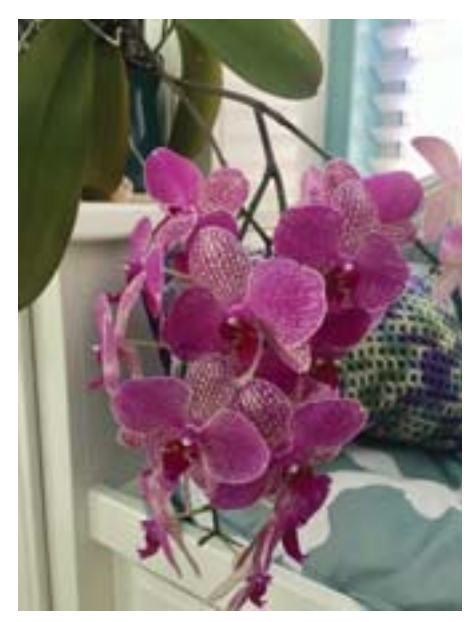
Indoors, a spotted mauve phalaenopsis orchid will bloom for months.

system. Succulents and cactus thrive in the heat and offer texture, color, form and interest when planted with consideration. Silk trees and oleanders provide a long blooming season, but do not let your hound chew on any oleander leaves as they are poisonous. A sparkling clean gurgling fountain can be the watering hole for your pet, while placing a small saucer filled with marbles or stones that I call a "butterfly bowl" will be a lifesaver for butterflies, bees, lizards, and other insects.