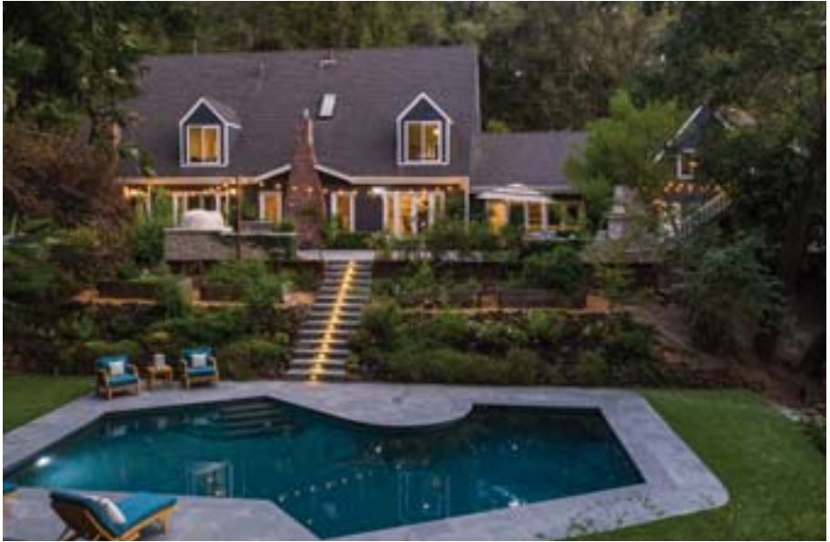
645 Miner Rd. Orinda 4BD + Office | 3.5 BA | 1BD/1BA In Law | 4915SF | 1.41 AC $3,280,000