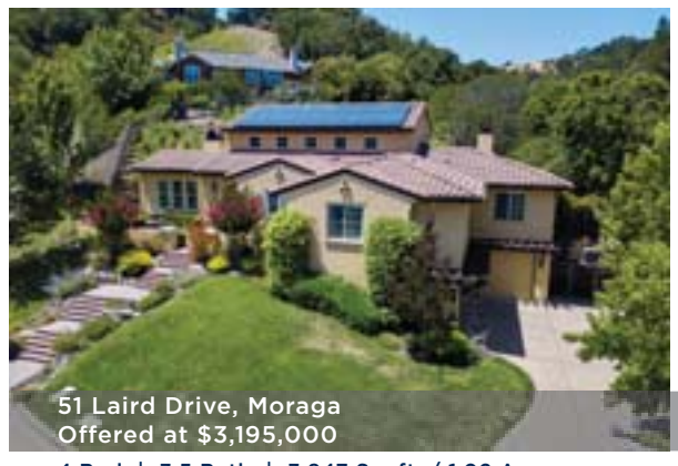
4 Bed | 3.5 Bath | 3,847 Sq. ft. / 1.02 Acres 3D tour at www.51Laird.com