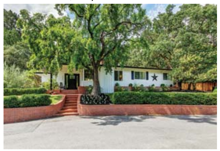
5+ BD | 2.5 BA | 2,942± SF | 0.52± AC | $1,795,000 Tucked away on a tree lined street in Burton Valley, this lovely remodeled single story has 5 bedrooms, a detached bonus room - ideal for home office - formal living and dining rooms, a separate family room, and a spacious flat backyard.