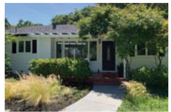
SOLD for $2,000,000