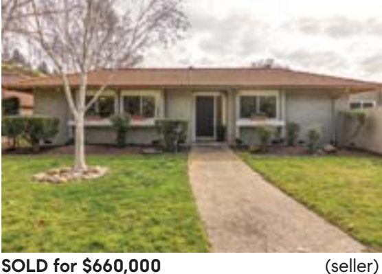
SOLD for $660,000