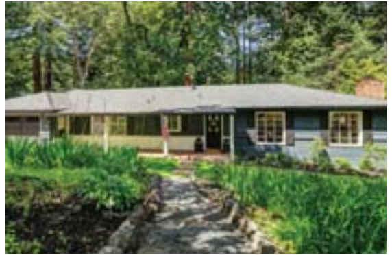
SOLD for $1,505,000