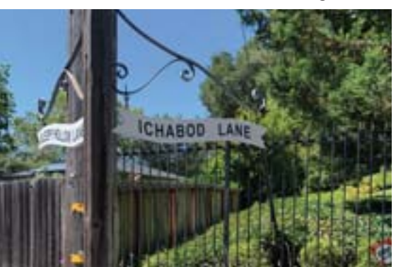
5BD | 3 BA | 2,587± SF | 1.28± AC | $1,595,000 Incredible Sleepy Hollow custom set on an oak studded view lot showcasing walls of glass, a remodeled kitchen / family room, and a rear patio with a spacious hot tub.