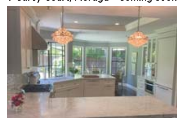
4 BD | 3 BA | 2,812± SF | 0.24± AC | $1,535,000 Picture perfect Sanders Ranch traditional with an ideal floorplan tucked away on a friendly cul-de-sac with a beautifully updated kitchen / family room and sunny level yard.