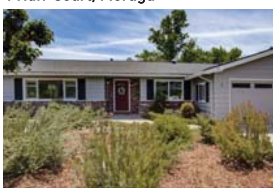
SOLD for $1,325,000