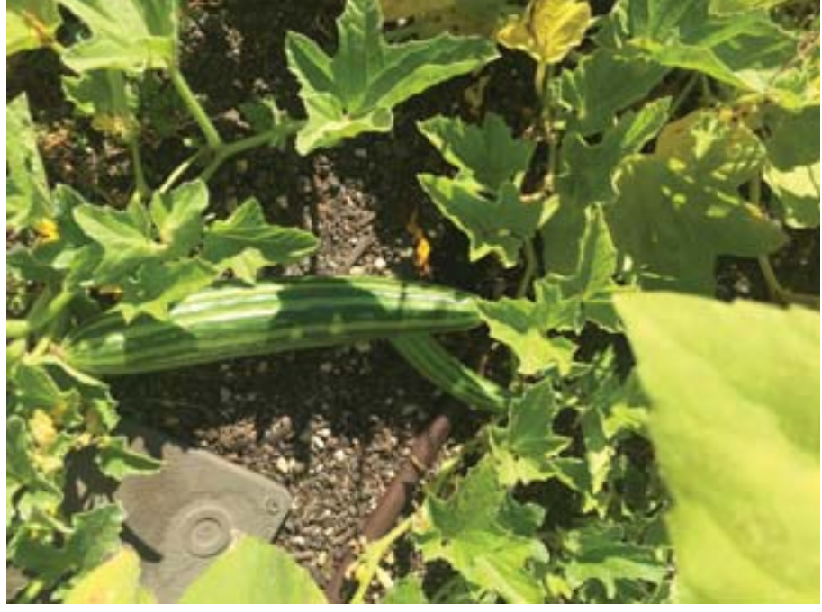
Armenian cucumbers are crunchy and low calorie, good for pooches,