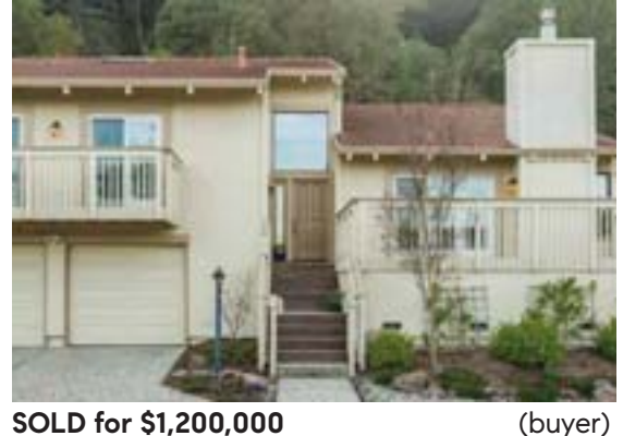
SOLD for $1,200,000