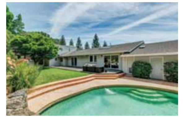
SOLD for $2,050,000 (seller)