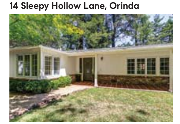
SOLD for $1,525,000 (seller)