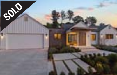
JULIE DEL SANTO/MATT MCLEOD