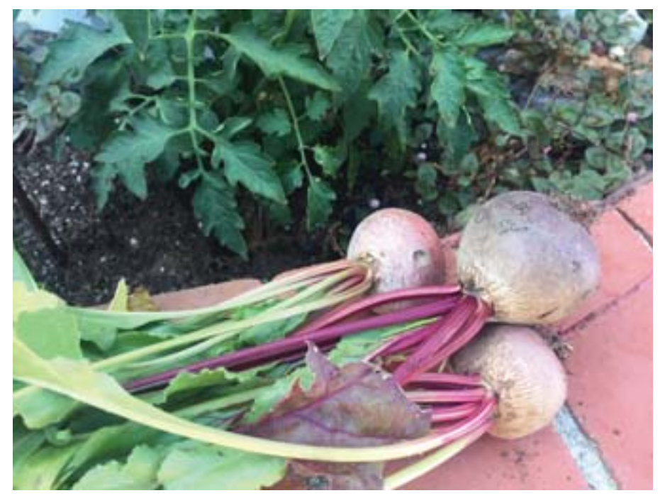
Freshly harvested beets are good for dogs. Don't feed them canned beets.