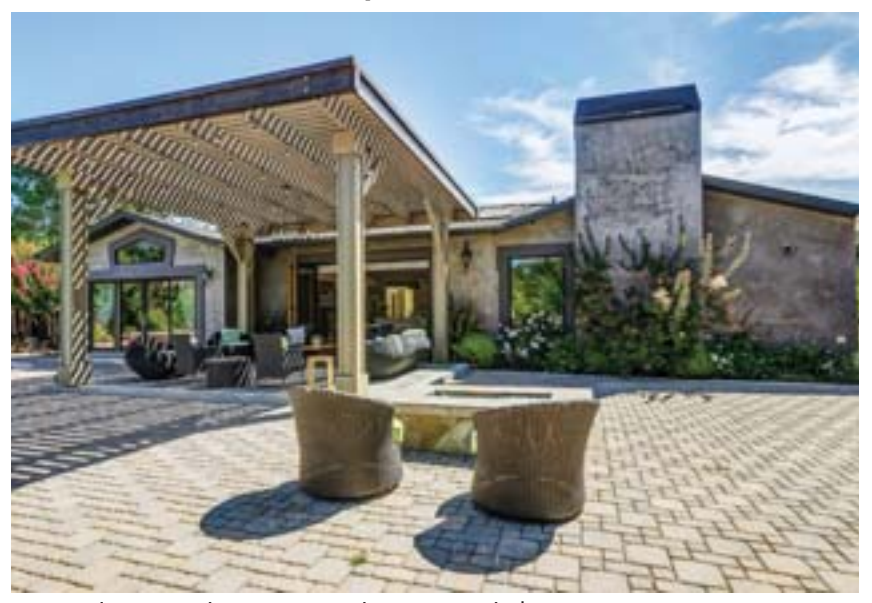
6+ BD | 5+ BA | 5,450± SF | 0.81± AC | $4,500,000 Stunning 'like new' Happy Valley single story set on a flat lot at the end of a cul-de-sac. High end finishes, spa-like master retreat and a resort-like backyard featuring a pool, outdoor kitchen and a fire pit conversation area, make this the ideal home! 3957rancho.com