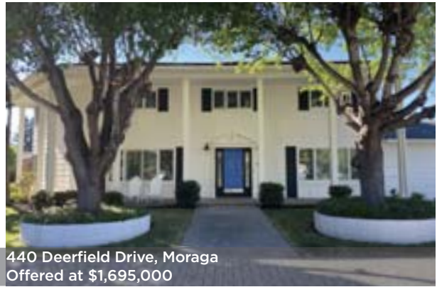
5 Bed | 2.5 Bath | 2,969 Sq. ft. / .24 Acres 3D tour at www.440DeerfieldDr.com