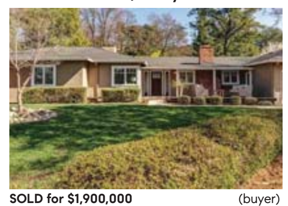
SOLD for $1,900,000