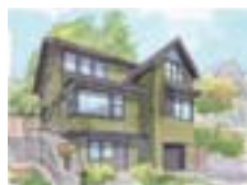
THE PRESCOTT | 4523 Howe Street