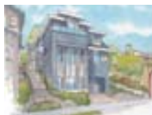
THE STINSON | 4521 Howe Street