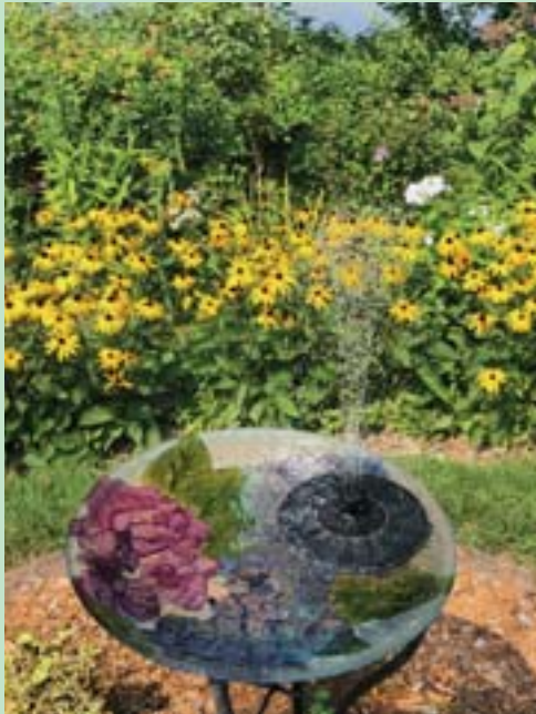
A fall fountain splashes flanked by a garden of black-eyed Susans.