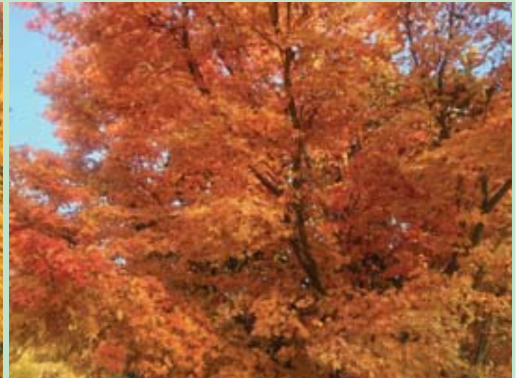
Four days later, the yellow leaves have turned to burnt fireworks orange.