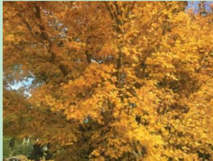
The mustard yellow leaves on the Japanese Maple.