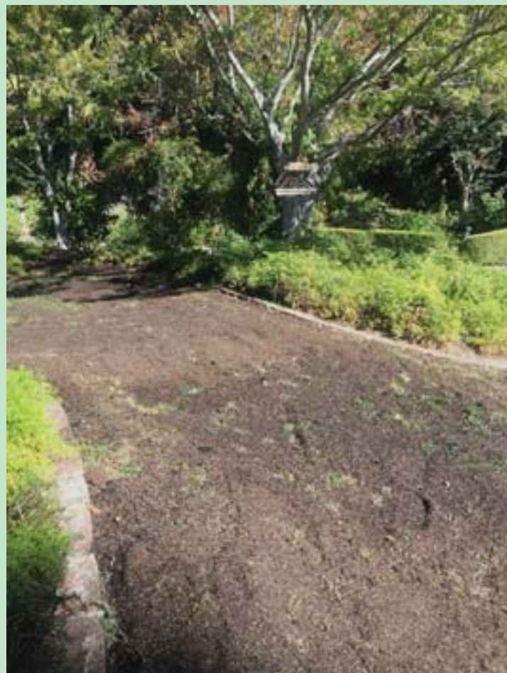
Top dressing on lawn to enrich the soil and cover the seeds.