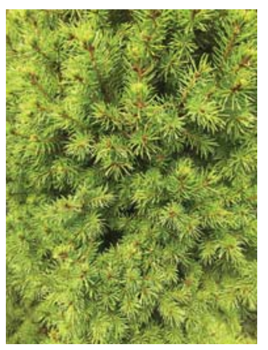
A small potted spruce tree can be decorated by children now and nurtured for the next season.