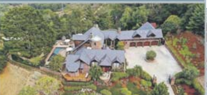
184 Alice Lane, Orinda