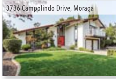
Sold for $1,340,000. Represented Buyers.