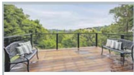
58 Oak Dr, Orinda