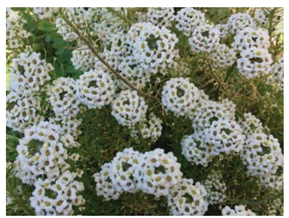
The pretty border plant, alyssum in purple or white is a perfect starter plant for kids.