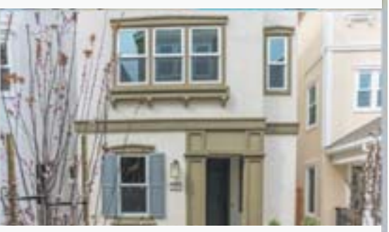
306 Ashton Way, Pleasant Hill