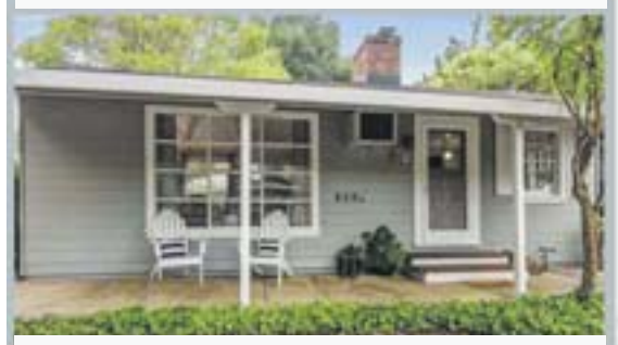
929 Hough Avenue, Lafayette