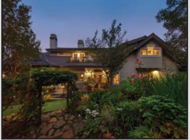
21 Hidden Valley Road, Lafayette 4 bd | 3 ba | 3679 sqft | .48 acre | $2,750,000 Outdoor Kitchen, Fireplace, Putting Green & Yard