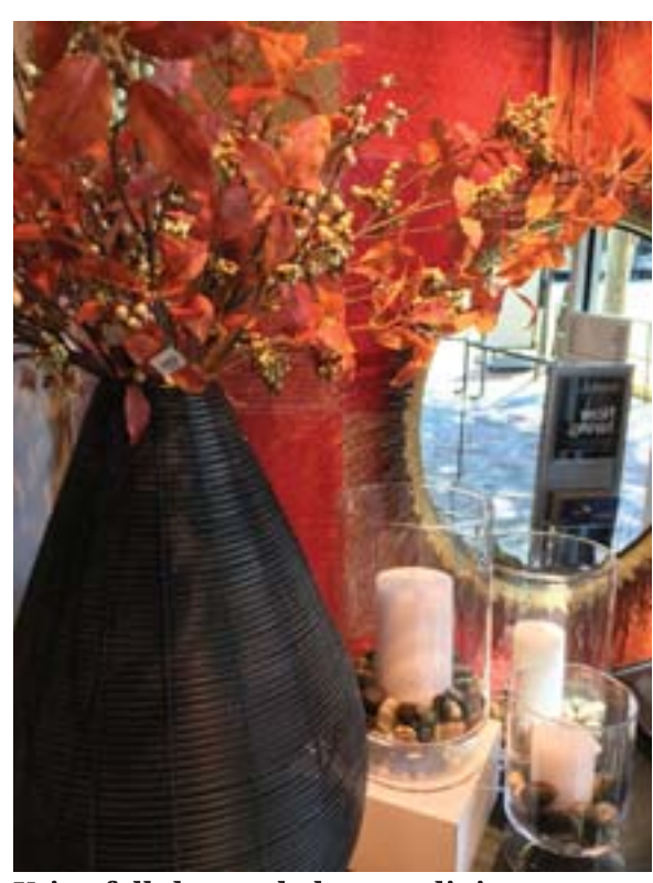
Using fall themes help set a dining room table that reflects the harvest & abundance of fall we want to share with others.