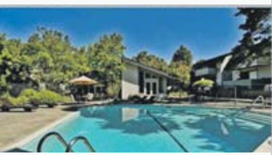
1493 Marchbanks Drive, Walnut Creek