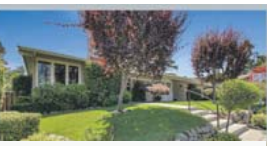
127 Warfield Drive, Moraga