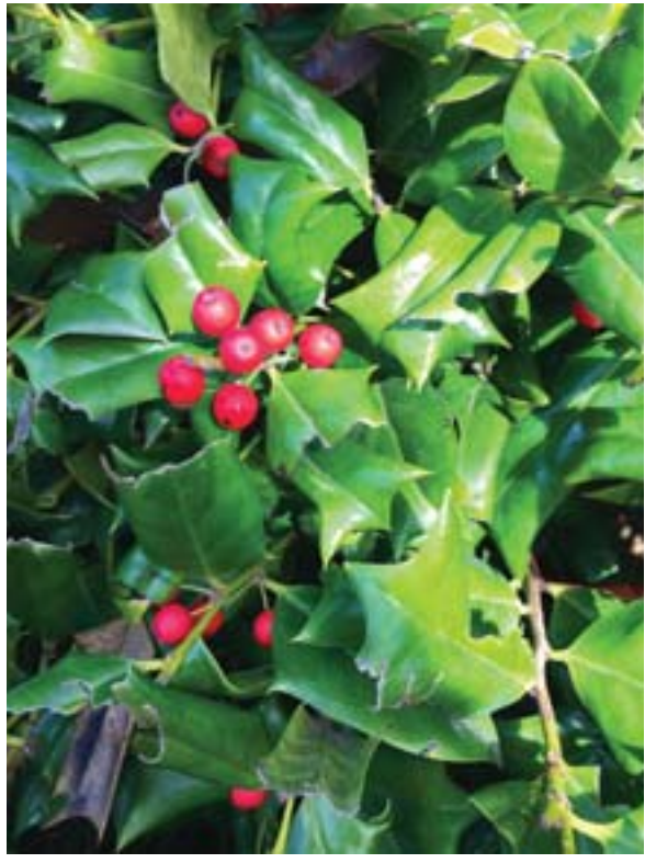
Holly is one of the most well-known holiday berries used in wreaths.