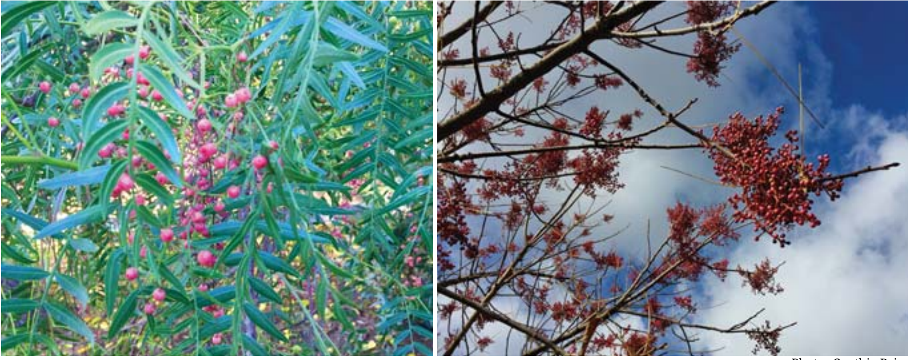
Pink peppercorns from the California pepper tree add tasty, mild flavors to food.