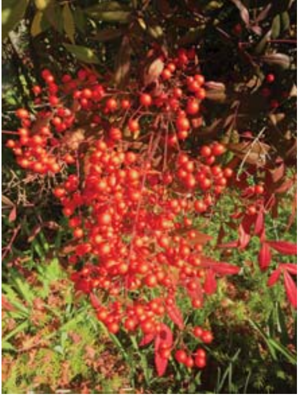
Nandina, also known as heavenly bamboo, is poisonous and deadly to all wildlife and domestic animals.

My garden boasts a plethora of winter berries that encourage my feathered friends to hang around for the holidays. Finches, mockingbirds,