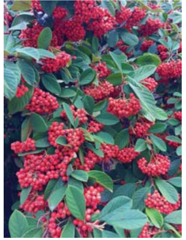
Cotoneaster berries provide a winter bird buffet.

Deciduous trees are barren of leaves, autumn perennials have finished their blooming cycle, and few flowers adorn the landscape. The glistening ornaments that embellish the foliage are a gastro delight for birds.