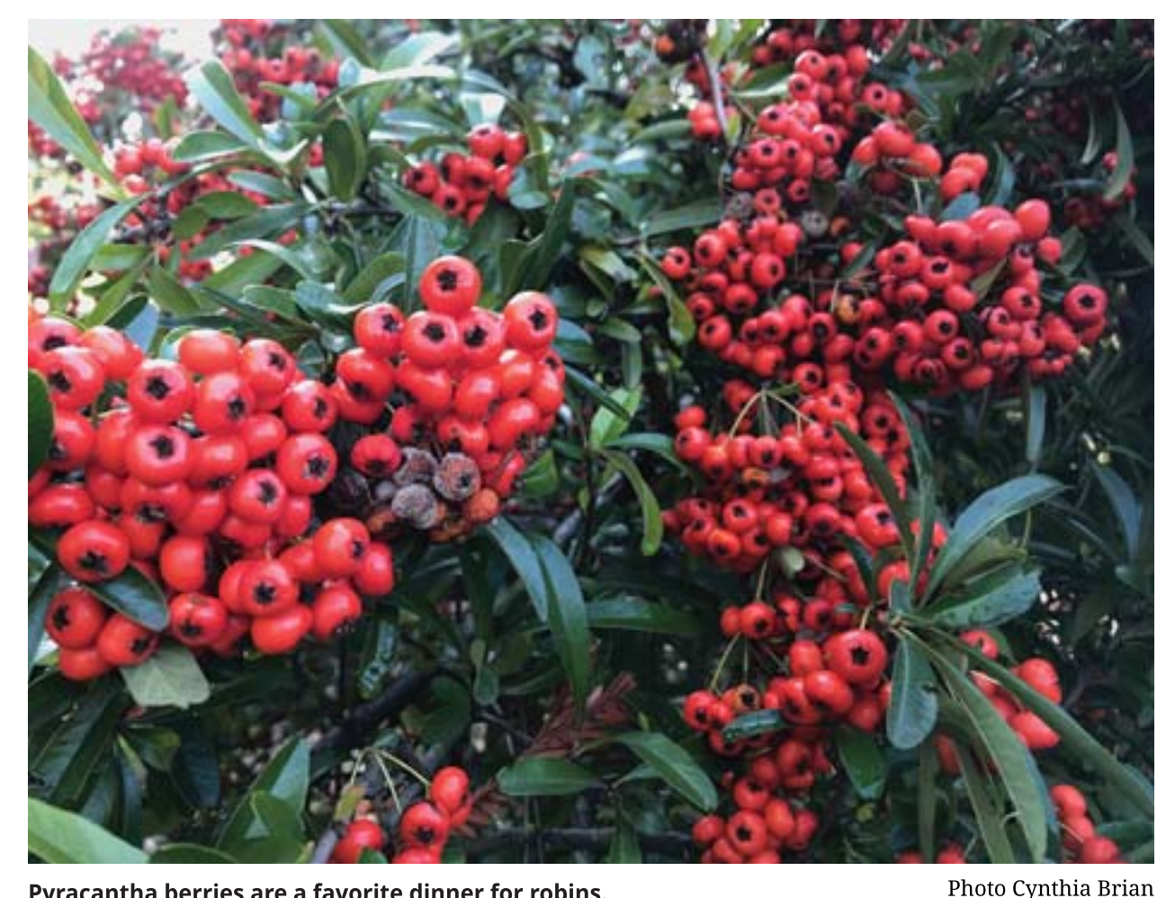
Pyracantha berries are a favorite dinner for robins.