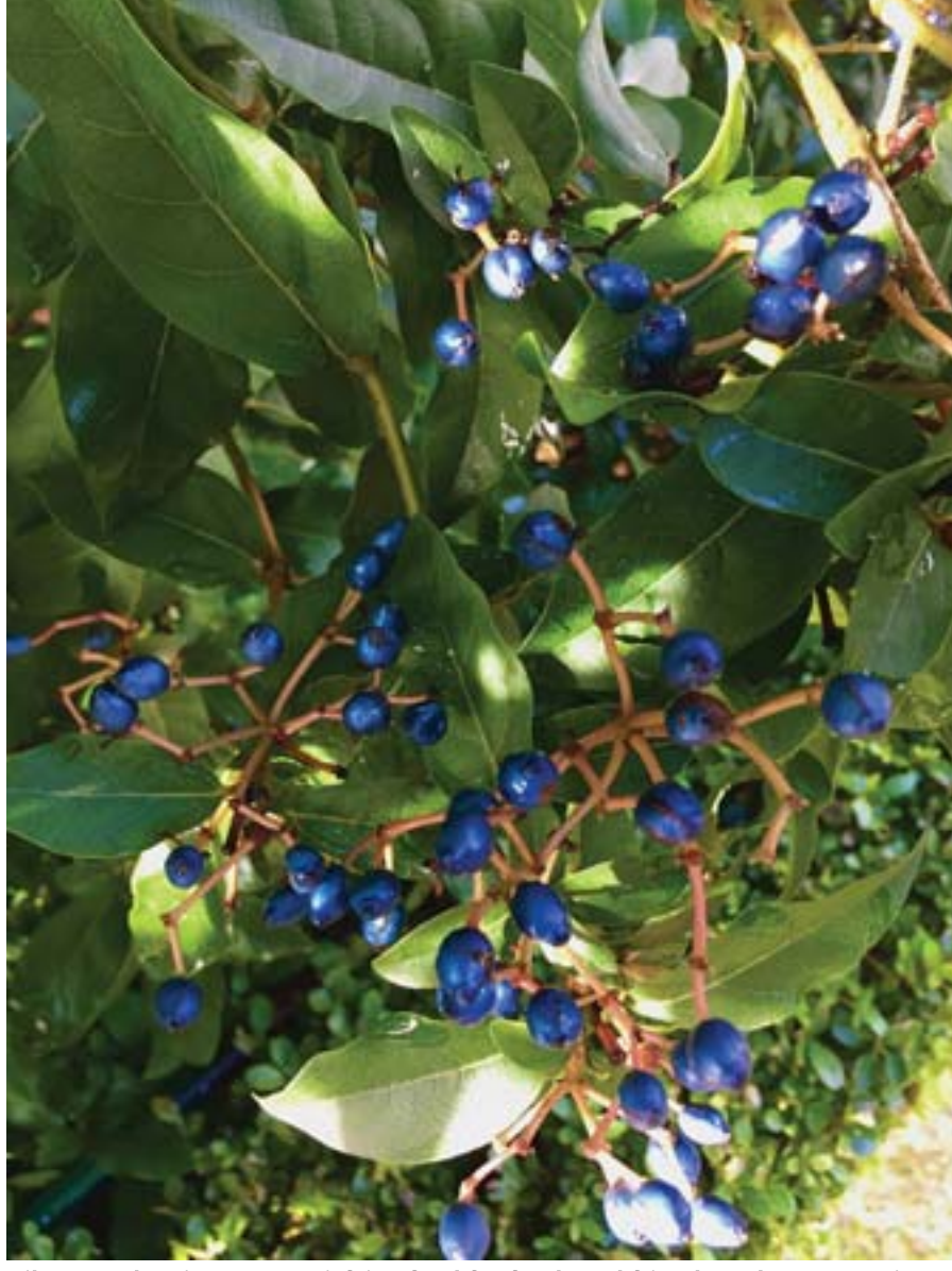
Viburnum berries are a satisfying food for feathered friends and some species are edible by humans.