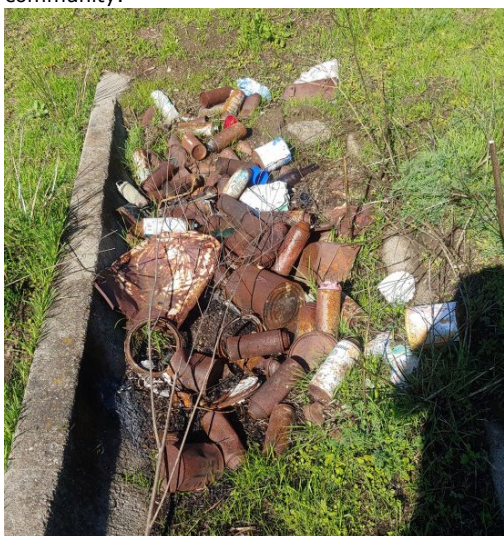
Debris found at Painted Rock

litter. "It makes us feel better to live in a clean house, wear clean clothes. It's the same with the environment," he states. "A clean environment makes us feel better about ourselves, our neighbors and our community."