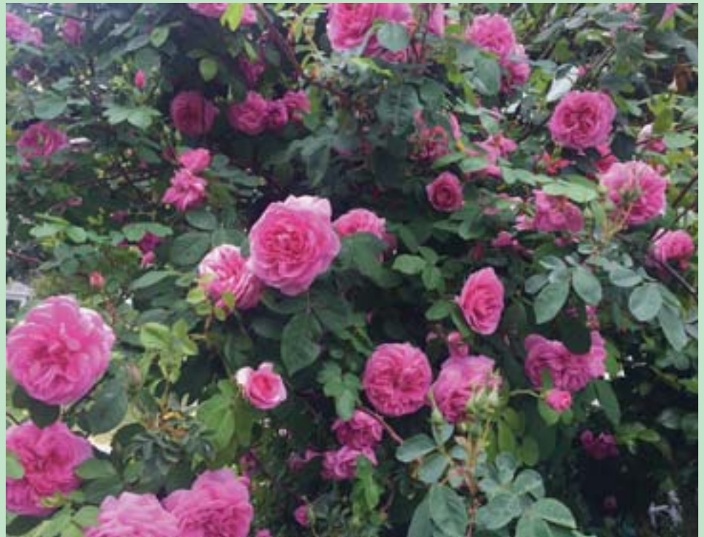
Gertrude Jekyll climbing roses blooming.