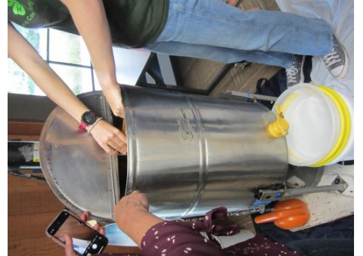
Placing the "scraped" frames into the extractor Photo Vera Kochan

"Scraping" the wax caps to expose the honey Photo Vera Kochan