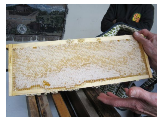
A completed full frame of capped honey

A unique learning experience in the form of a honey harvest was presented to local residents by Lamorinda Bees who teamed up with Mount Diablo Beekeepers Association to give folks a bee-to-honey demonstration during the June 4 event.