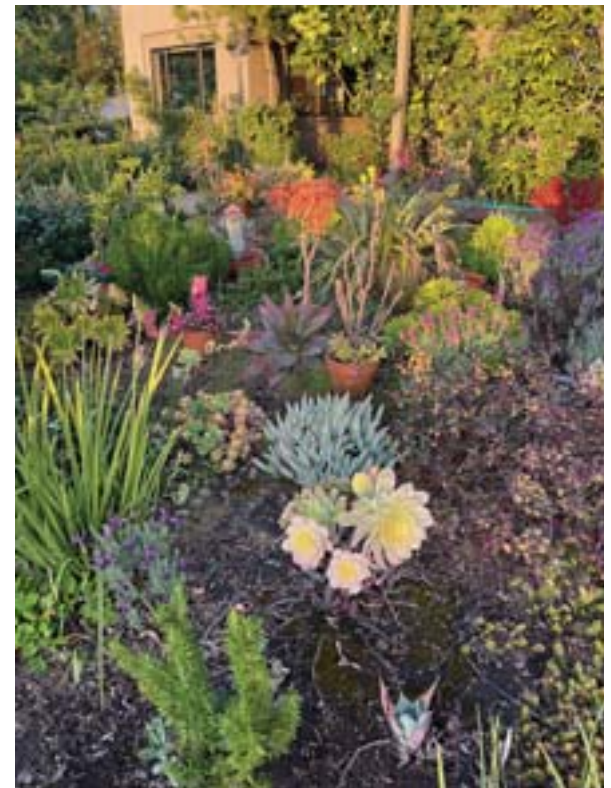
A kaleidoscope of succulents offers texture and form in a garden.

Succulents have fleshy, thick leaves that store water and thrive in warm, dry conditions. They are very low maintenance, prefer dry conditions, and enjoy copious amounts of sunshine. Cactus are succulents, although most gardeners prefer succulents that do not have spines, stickers, or prickly pokes. Succulents are beautiful and come in a range of colors including green, silver, orange, yellow, purple, lavender, pink, red, bronze, and mixtures. The more sunlight they receive, the more colorful they become. Many of the fleshy leaves are arranged in rosettes. Succulents are easy to