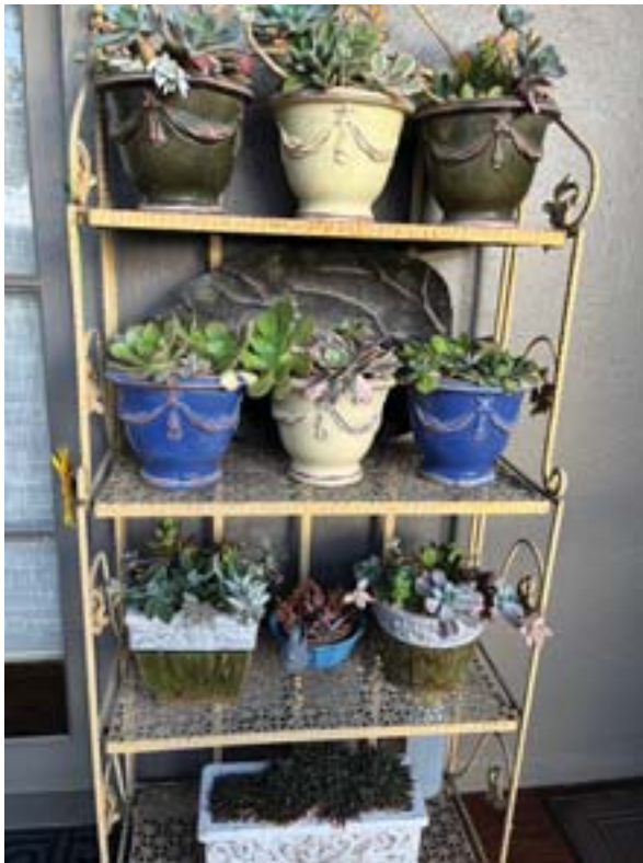
Small succulents in pots result in a minimal maintenance display