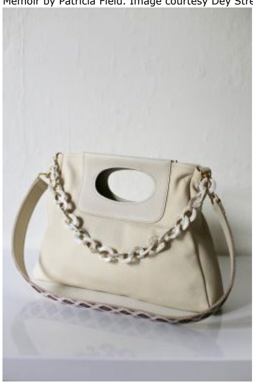
The Cassie in Imperial Dune

Reach the reporter at: \underline{info@lamorindaweekly.com}