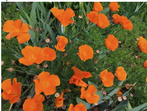
California poppies are the state flower and propagate by seed.