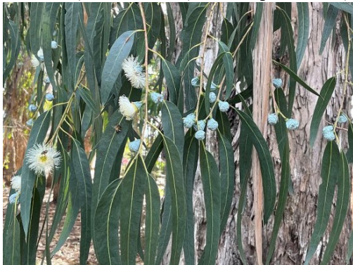
Eucalyptus is endemic to Australia and should not be planted in our region because of fire danger.