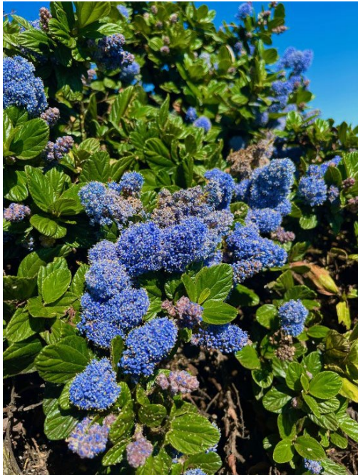
Ceanothus, California lilac, is a drought-tolerant, flowering native.

plant will flourish. AERATE lawns and leave the plugs on the grass as fertilizer. SHARPEN and clean tools for the spring workload. HARVEST oranges. BUY pots of oxalis, also known as shamrocks, to decorate for St. Patrick's Day. PLANT milkweed to attract Monarch butterflies. START weeding to get a jump start on spring plantings. DISPOSE of fallen camellia blossoms until bushes are finished blooming to prevent disease.