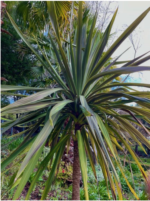
Used both indoors and outdoors, Cordyline is a genus of plants native to Pacific islands and Southeast Asia.